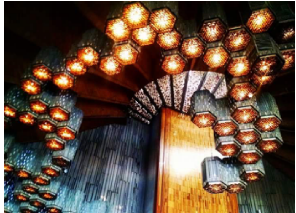
“The Ceiling of Mexico's Basilica of Our Lady of Guadalupe”