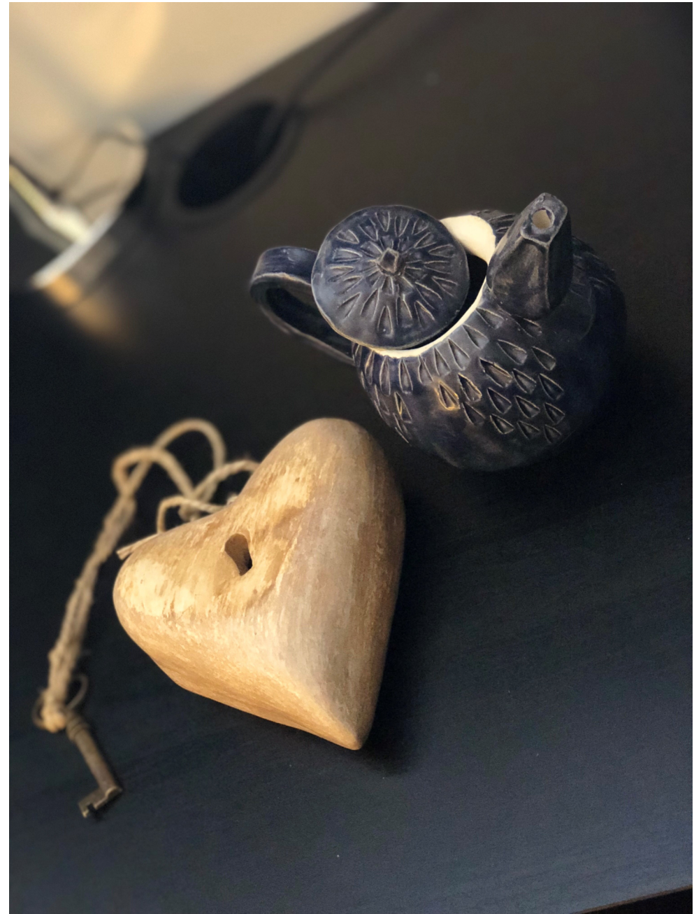
Untitled

In the blink of an eye, eight-inch razor sharp fangs extend in silence; four-inch claws accompany them as the Cyberdog lunges to the source of the sound. Tearing through the drywall the Cyberdog's head emerges less than an inch from NightShade's. Stuck in the drywall, fangs clawing in silence. "Fuck!" he exclaims as he draws his pistol and turns, placing the nozzle at the mouth of the Cyberdog