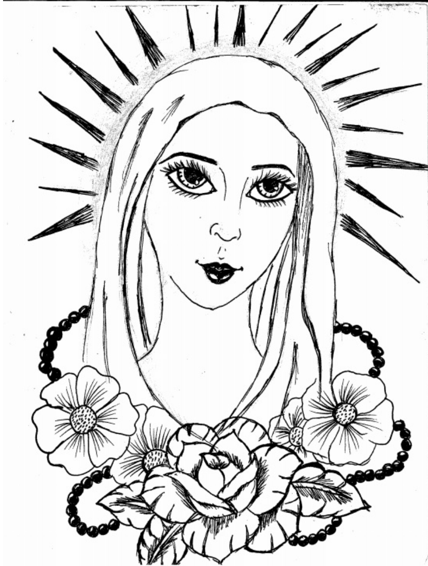
“Mother Mary Adorned in Flowers and Rosary Beads”