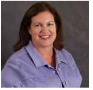
"Even during the first class period before any of us knew each other, everyone was energized and asking good questions."