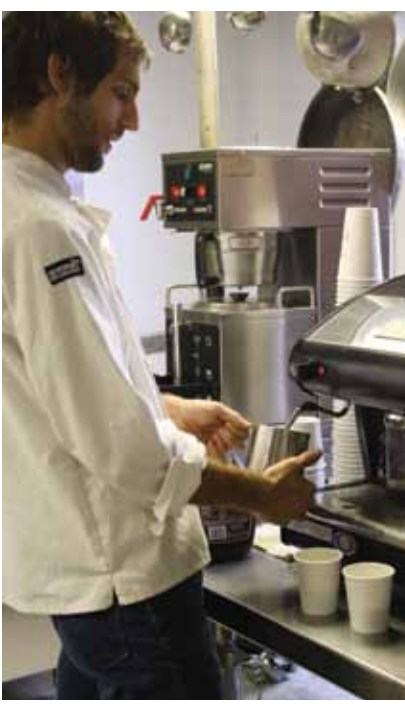
Above left: A crane lifts construction materials to the roof of Donnelly's main building as part of the project to replace the building's two elevators. Above right: The new food service on campus, provided by Bistro Kids, includes specialty coffees like these cappuccinos.