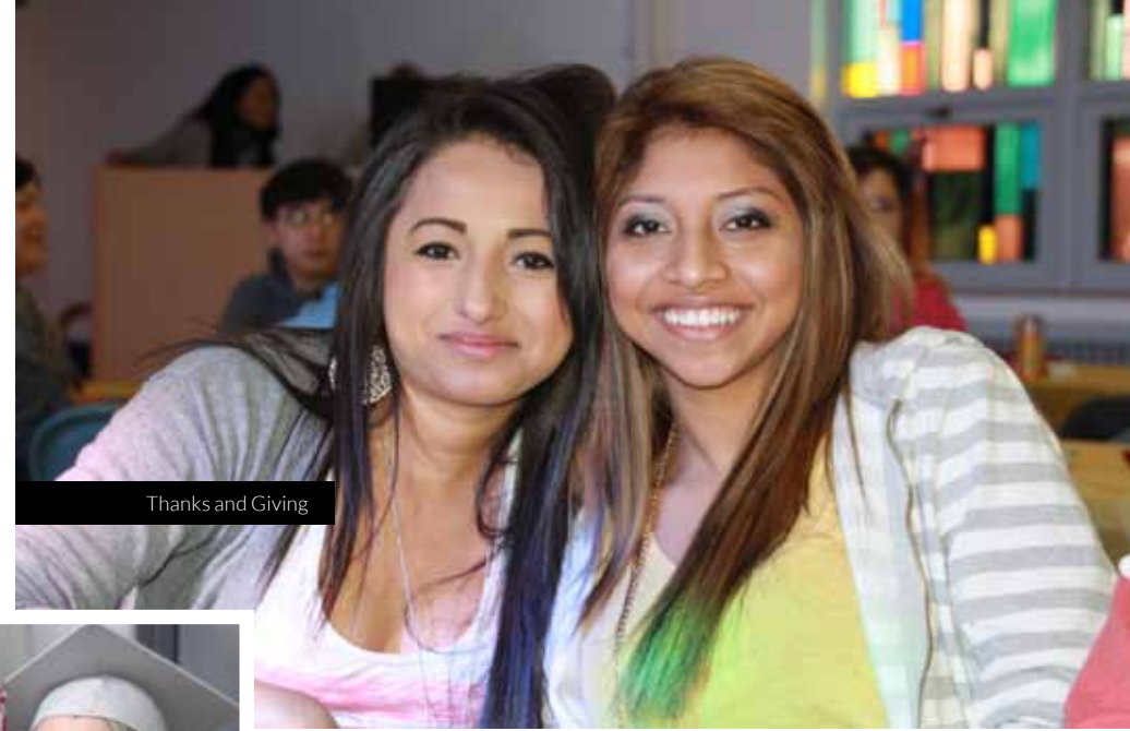
Thanks and Giving