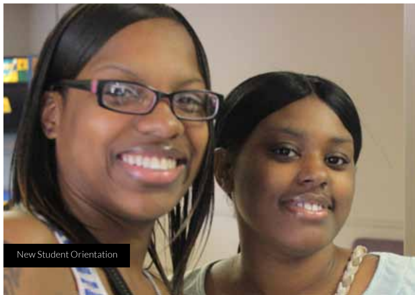
New Student Orientation