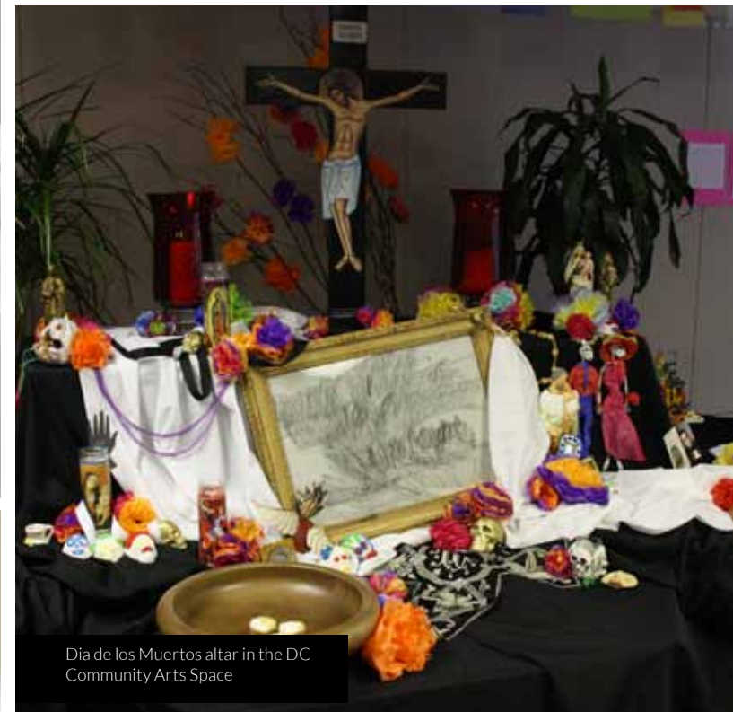
Dia de los Muertos altar in the DC Community Arts Space