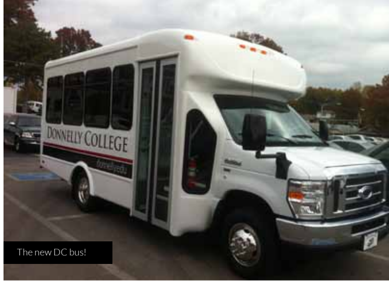
The new DC bus!