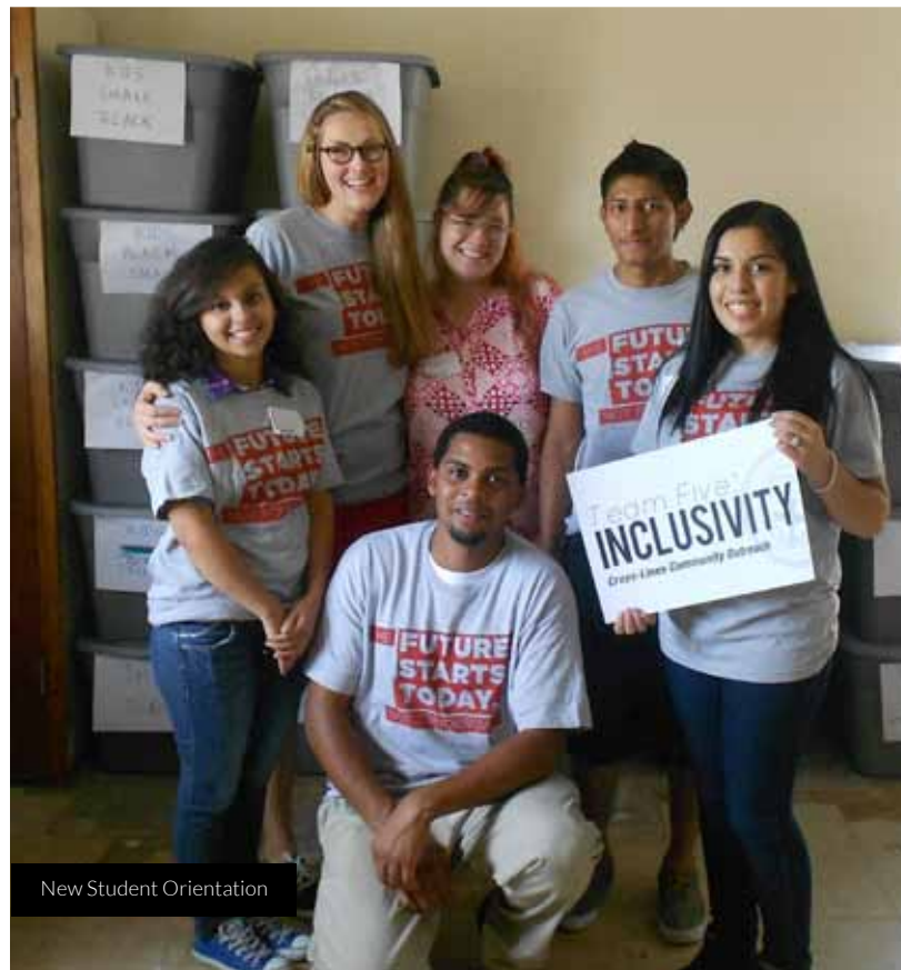
New Student Orientation