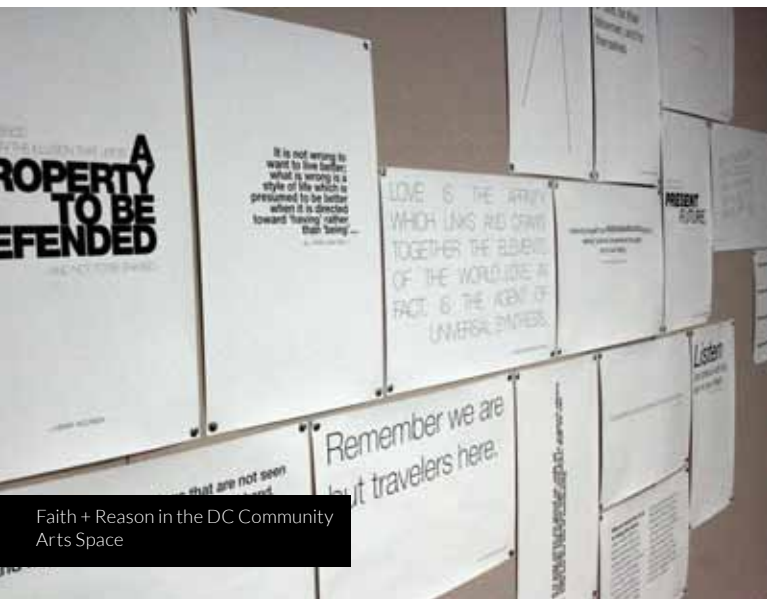
Faith + Reason in the DC Community Arts Space