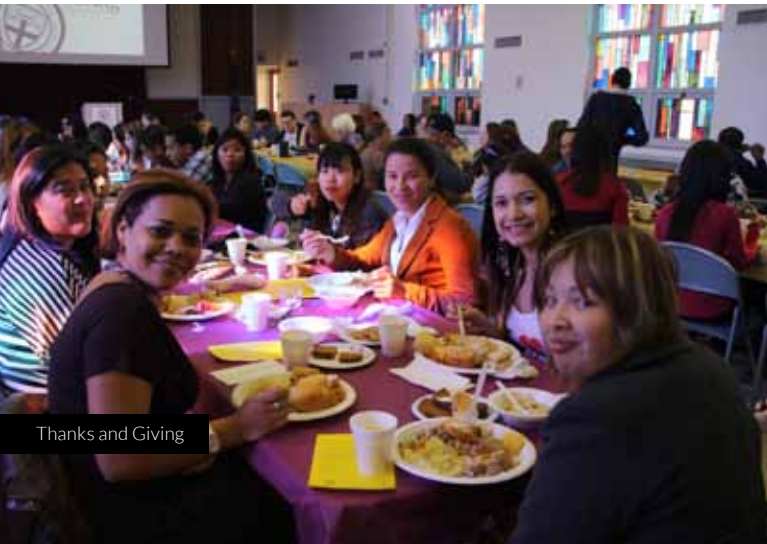
Thanks and Giving