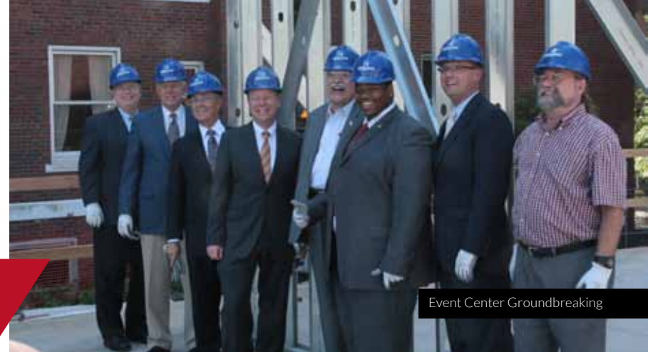
Event Center Groundbreaking