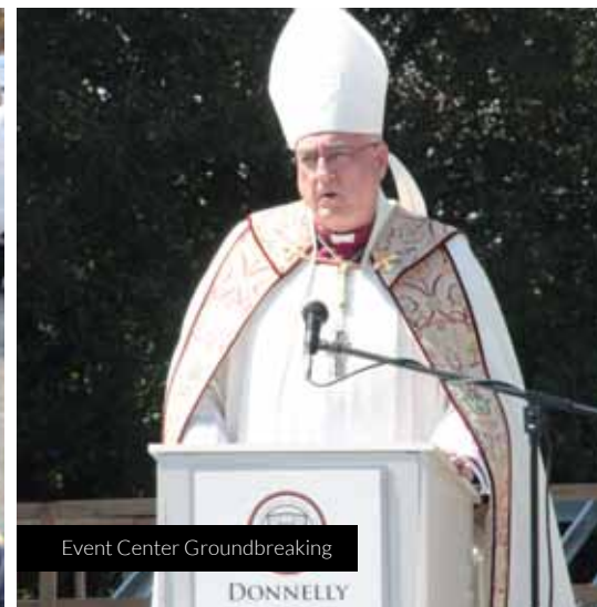
Event Center Groundbreaking