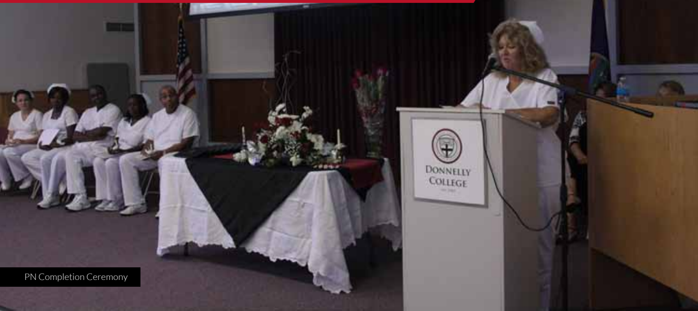
PN Completion Ceremony