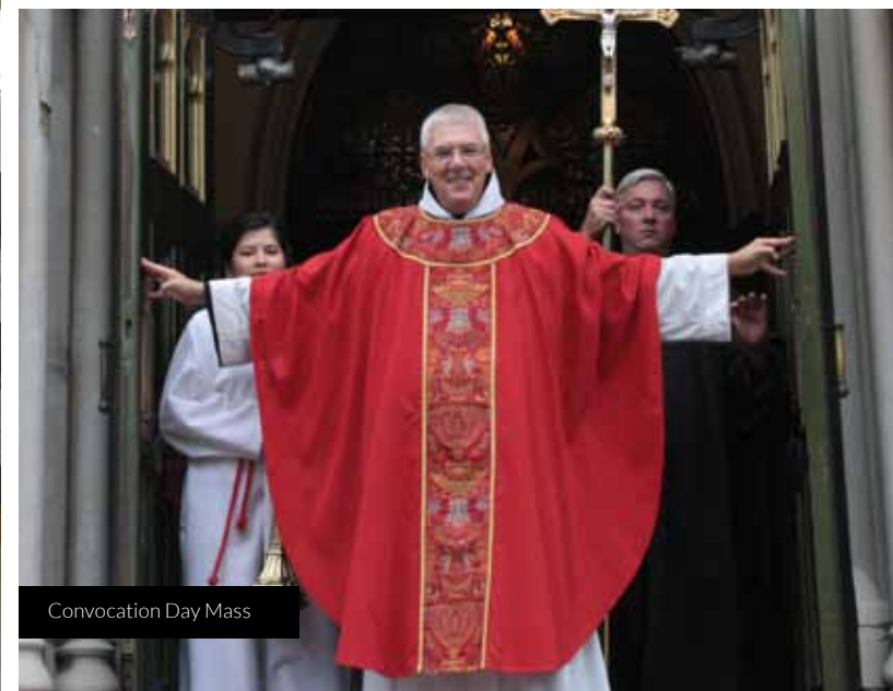
Convocation Day Mass